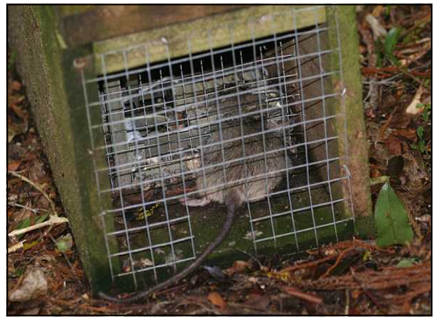
Trap box with ship rat